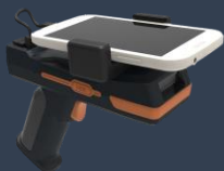
Barcode Only (Gun)