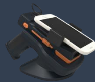
At the same time charging Scanner & Phone