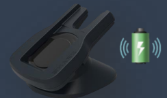
Wireless Charger Cradle