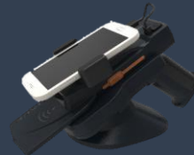
At the same time charging Scanner & Phone