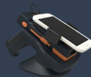
At the same time charging Scanner & Phone