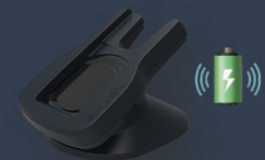
Wireless Charger Cradle