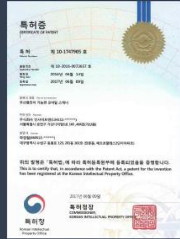
PATENT OF KOREA